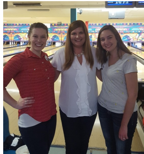
Bowl for Kids' Sake