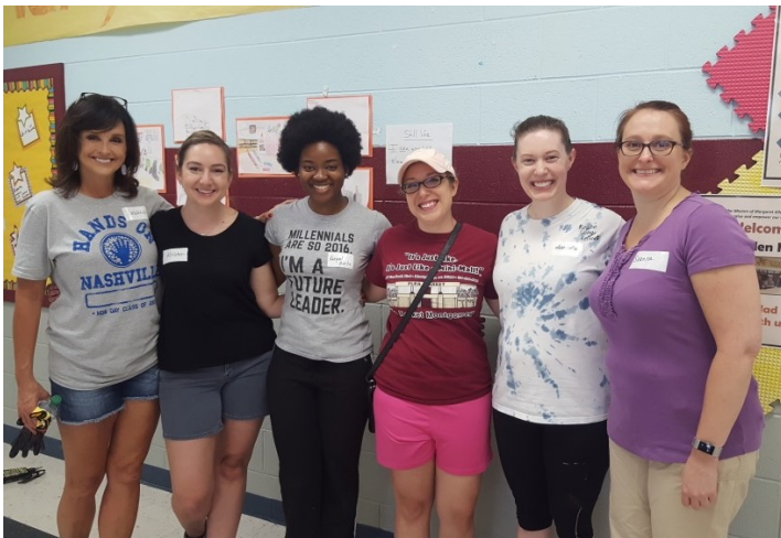
LAW Members at HON Day 2017

LAW members have been busy giving back to the community!! In May and June, LAW members collected and donated forty-seven books to Book 'Em, a non-profit here in Nashville. Members also raised $425 and enjoyed a night of bowling for Big Brothers Big Sisters' Bowl for Kids' Sake in July. On September 23, LAW members volunteered their time for Hands on Nashville Day 2017 and helped paint the hallways and plant trees at Margaret Allen Middle Prep school. In October, LAW members conducted a pro bono clinic at the AMAC Empowering Women Conference. Thank you so much to all of these volunteers for donating time, financial support, and more!! The Community Relations Committee is currently collecting business clothing in all sizes, shoes (especially sizes 9 & up), purses, and gift cards in small increments ($10-$25) to stores like Target, TJMaxx, Marshalls, and Walmart. These donations will benefit the Dress for Success program and the Nashville Rescue Mission Women's Department. You can drop off your items at the Nashville Bar Association or at the annual member CLE or holiday mixer on December 13th. Thank you to everyone who has already donated!!